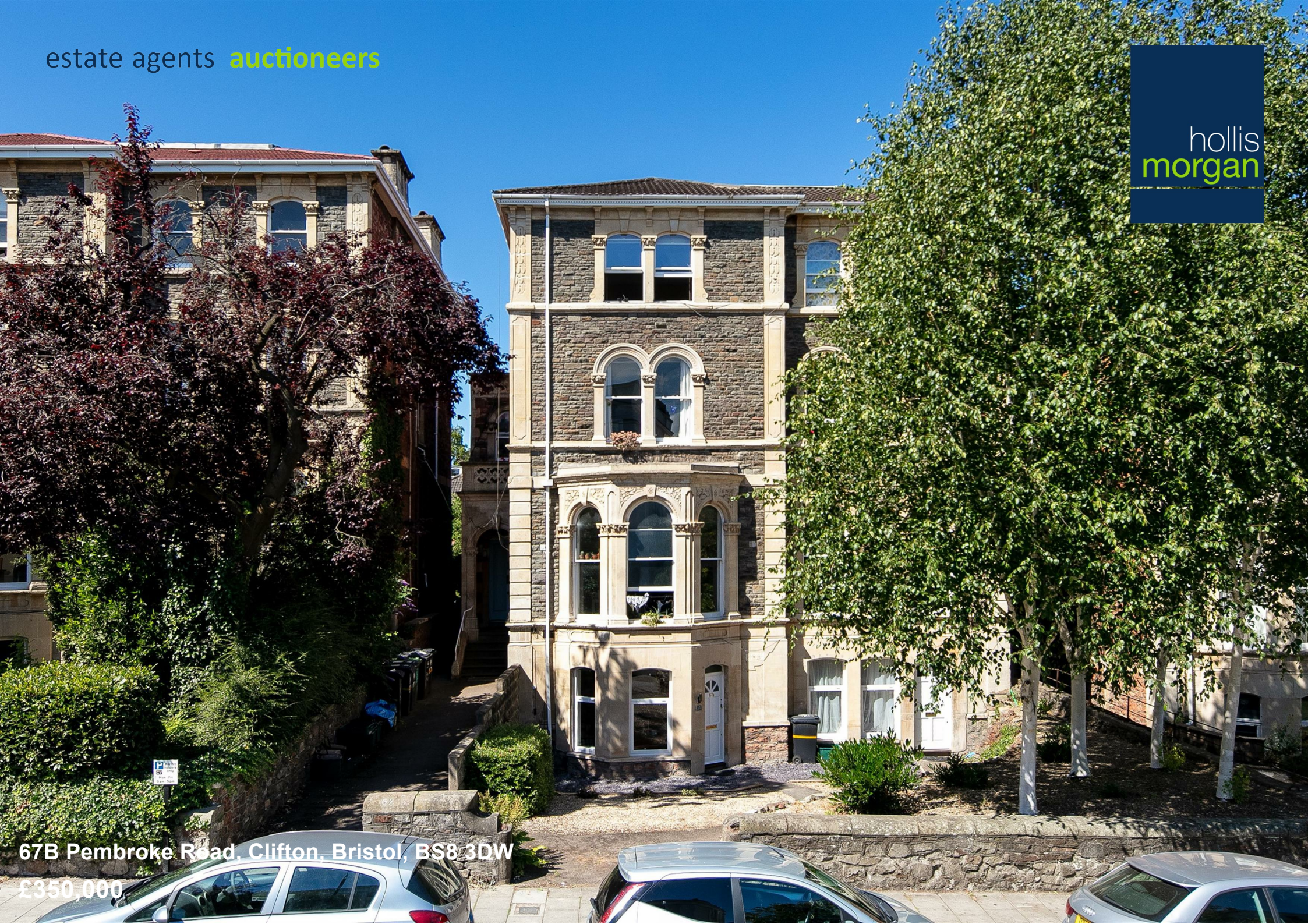
67B Pembroke Road, Clifton, Bristol, BS8 3DW